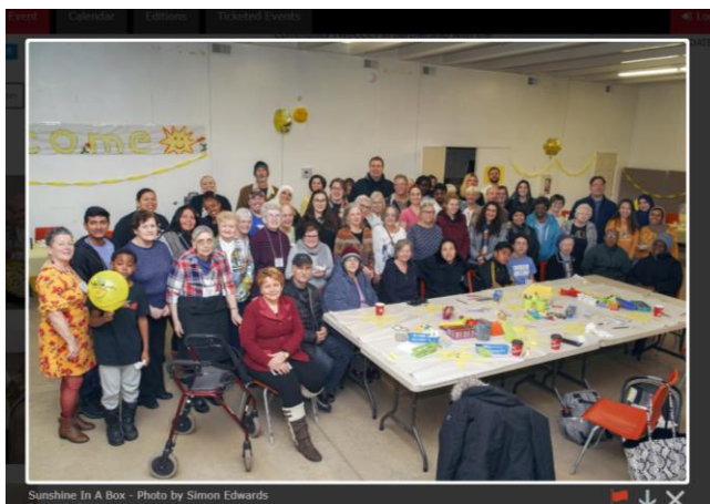
Sunshine In A Box

https://windsor.snapd.com/events/view/1310481